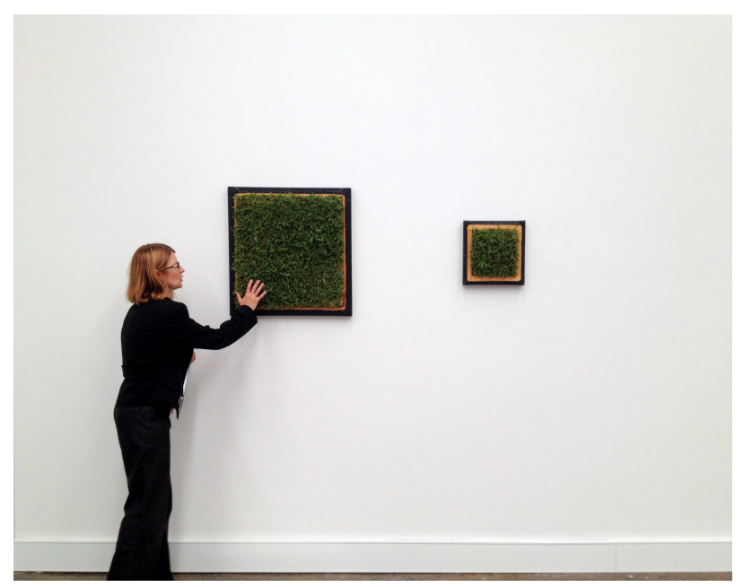
The forbidden touch: a viewer lightly stroking Terra Nullius , 2013 along side Black Gold , 2013.

Other works include Black Gold and Terra Nullius , 2013 Gatfield's first pieces to incorporate blocks of native Australian grass. They are essentially living artworks; each grass patch stitched to the canvas, and require regular watering. These sensory "organic abstractions" or "plump paintings," as the artist refers to them, beg to be touched; a privilege Gatfield openly encourages.