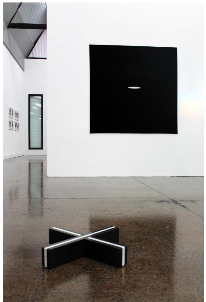
Gatfield's Multiple Choice , 2013 & Black Velvet , 2013.

Both well-established artists themselves, the directors collaboration with Gatfield was a natural meeting of like minds. With their combined affinity with contemporary abstract art, and a muse like Malevich, Langford120 served as an ideal venue to tackle Suprematist theory and toy with concepts of formalism, scale, gravity, time and space.