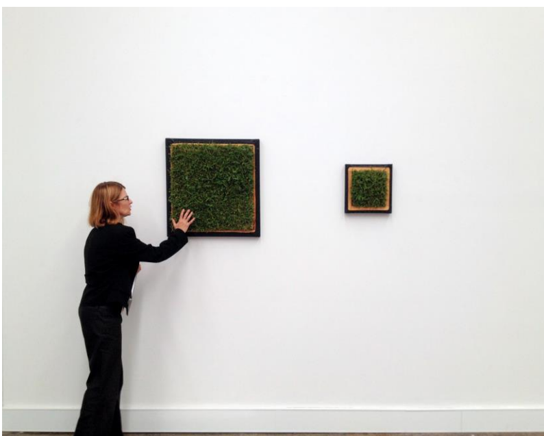
The forbidden touch: a viewer lightly stroking Terra Nullius , 2013 along side Black Gold , 2013.

Other works include Black Gold and Terra Nullius , 2013 Gatfield's first pieces to incorporate blocks of native Australian grass. They are essentially living artworks; each grass patch stitched to the canvas, and require regular watering. These sensory "organic abstractions" or "plump paintings," as the artist refers to them, beg to be touched; a privilege Gatfield openly encourages.