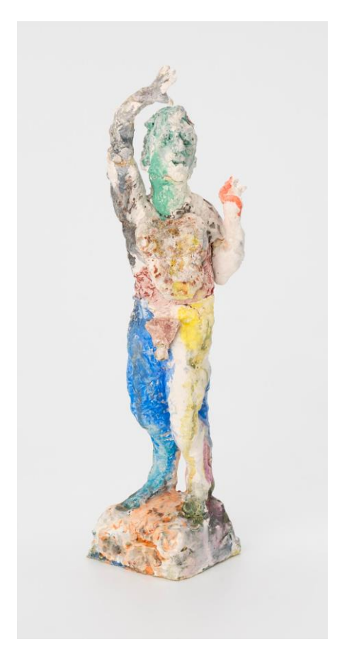
Stephen Benwell, Statue , arm raised, 2011, 54 x 12 x 12 cm, earthenware Melbourne Now, National Gallery of Victoria

The strong-jawed Double Agents may be many times the size of the superheroes they mimic but their capacity is strangely lesser, marooned in their solid form. The cutesy Betty Boopmeets-Japanese-schoolgirls in Away with the Fairies lose their charm and sexiness to confront us with the grotesqueness of pornographic blow-up dolls. Our media obsessions are parodied but so too are our beliefs about size, power and supremacy.